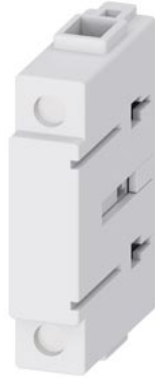
PE-through terminal, Front installation, accessory for Load disconnector 3LD3