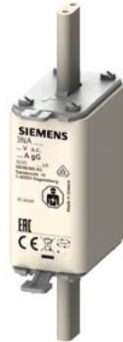
LV HRC fuse element, NH0, In: 50 A, gG, Un AC: 500 V, Un DC: 440 V, Front indicator, live grip lugs