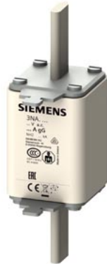
LV HRC fuse element, NH2, In: 100 A, gG, Un AC: 500 V, Un DC: 440 V, Front indicator, live grip lugs