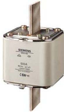
LV HRC fuse element, NH4a, In: 500 A, gG, Un AC: 500 V, Un DC: 400 V, Front indicator, live grip lugs