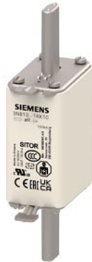
SITOR fuse size 0 32A aR 600V dc/900V VSI 750V dc UL @MBC 4xIn blade contacts