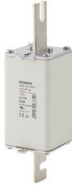
SITOR fuse link, with slotted blade contacts, NH2L, In: 400 A, aR, Un DC: 1250 V, front indicator