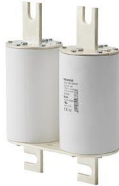
SITOR fuse link, with slotted blade contacts, 2 x NH3L, In: 1000 A, aR, Un DC: 1250 V, front indicator