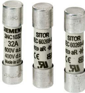
SITOR cylindrical fuse link, 14x51 mm, 5 A, aR, Un AC: 690 V, Un DC: 700 V, DC according to UL