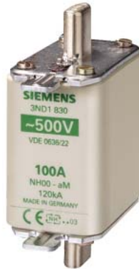
LV HRC fuse element, NH00, In: 100 A, aM, Un AC: 500 V, Un DC: 440 V, front indicator