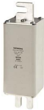
SITOR fuse link, with slotted blade contacts, NH2, In: 63 A, gR, Un AC: 1500 V, Un DC: 1000 V, without Indicator