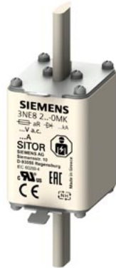
SITOR fuse link, with blade contacts, NH1, In: 200 A, aR, Un AC: 690 V, Un DC: 440 V, front indicator