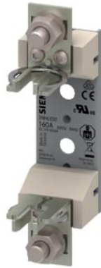
HRC fuse base ceramic Sz.00 1-pole 160A 690V (1000V) flat terminal