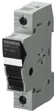
SENTRON, cylindrical fuse holder, 10 x 38 mm, 1-pole, In: 30 A, Ue DC: 1000 V, LED Signal detector, for photovoltaic application