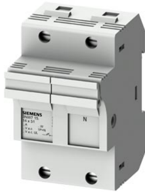
SENTRON, cylindrical fuse holder, 14x51 mm, 1P+N, In: 50 A, Un AC: 690 V