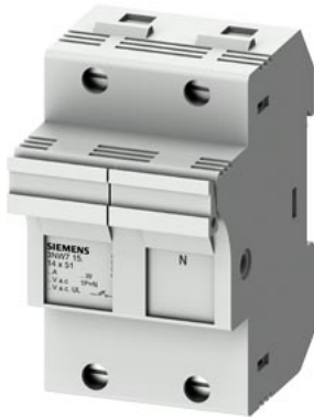
SENTRON, cylindrical fuse holder, 14x51 mm, 1P+N, In: 50 A, Un AC: 690 V, LED signal detector