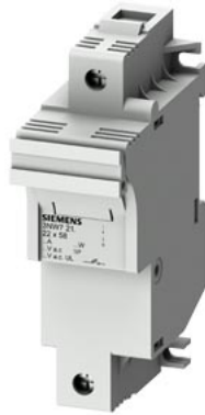
SETRON, cylindrical fuse holder, 22x58 mm, 1-pole, In: 100 A, Un AC: 690 V