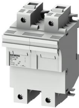
SENTRON, cylindrical fuse holder, 22x58 mm, 2-pole, In: 100 A, Un AC: 690 V, LED signal detector