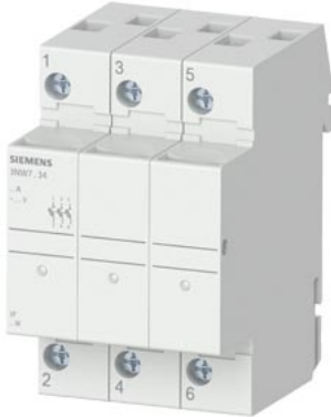
SENTRON, cylindrical fuse holder, 8x32 mm, 3-pole, In: 20 A, Un AC: 400 V, LED signal detector