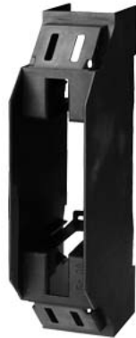
ISO cover IP2X Sz. 00 for LV HRC fuse base Sz. 00