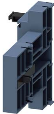
connector for YD combination, Module. S6-S6-S3 (2x 3RT1.5, 1x 3RT2.4)