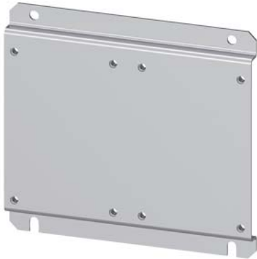
Base plate for mounting of combination of two contactors (2x 3RT1.6) for reversing