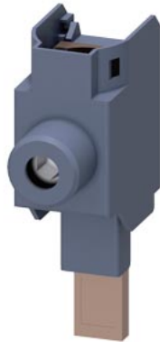
1-phase supply terminal, for contactors 3RT204, 3RT244 and 3RT264