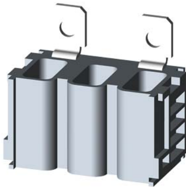
Adapter for screw mounting