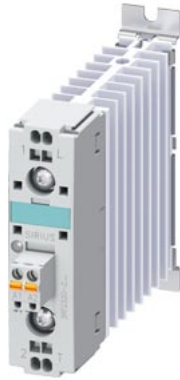
Solid-state contactor 1-phase 3RF2 AC 51 / 20 A / 40 °C 48-600 V / 24 V DC Spring-type terminal