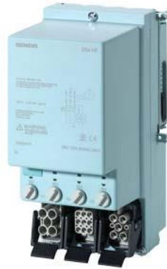
ET 200pro RSE HF Reversing starter High Feature Mechanical switching Electronic overload protection AC-3, 0.9 kW / 400 V 0.15 A...2.00 A Brake contact 400 V AC 4 DI Han Q4/2 - Han Q8/0