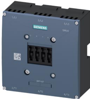
Arc chute for 3RT1075