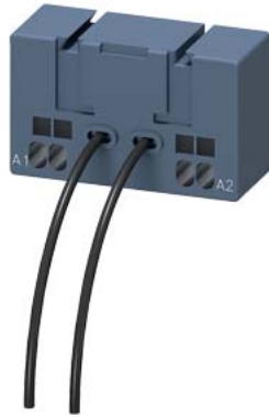
coil connection module connection from below, spring-loaded terminal, for contactors 3RT2.2