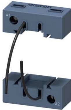
coil connection module connection diagonal, screw terminal, for contactors 3RT2.2, 3RT2.3, and 3RT2.4