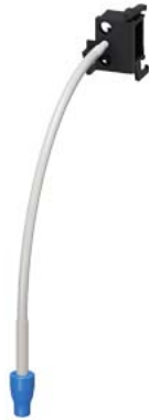
Cable release for reset 0.6 m for 3RU2 Size S00...S3