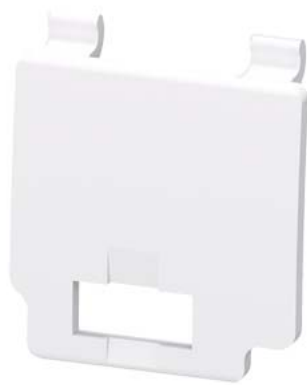
scale cover, sealable for circuit breaker 3RV2 Size S00...S3