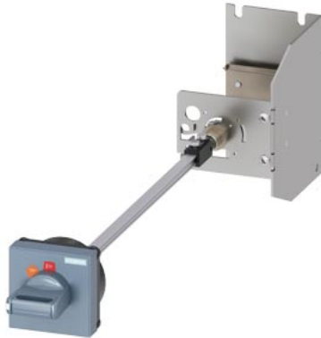
Door-coupling rotary operating mechanism for harsh conditions For circuit breaker Size S00/S0 Handle gray