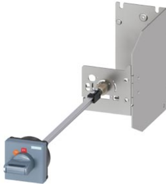
Door-coupling rotary operating mechanism for harsh conditions For circuit breaker Size S2 Handle gray