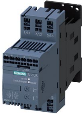
SIRIUS soft starter S00 12.5 A, 5.5 kW/400 V, 40 °C 200-480 V AC, 24 V AC/DC Spring-type terminals