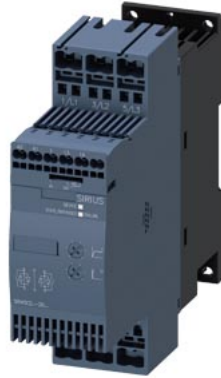
SIRIUS soft starter S0 25 A, 11 kW/400 V, 40 °C 200-480 V AC, 24 V AC/DC spring-type terminals