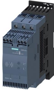
SIRIUS soft starter S2 45 A, 22 kW/400 V, 40 °C 200-480 V AC, 24 V AC/DC Screw terminals