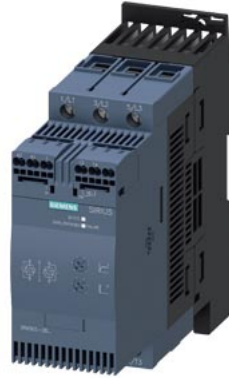
SIRIUS soft starter S2 72 A, 37 kW/400 V, 40 °C 200-480 V AC, 24 V AC/DC spring-type terminals