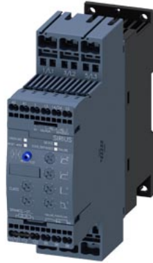
SIRIUS soft starter S0 25 A, 11 kW/400 V, 40 °C 200-480 V AC, 24 V AC/DC spring-type terminals Thermistor motor protection