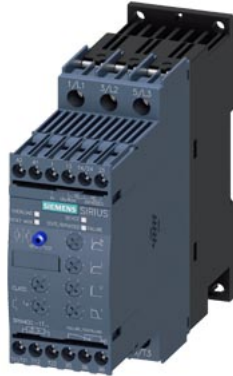
SIRIUS soft starter S0 32 A, 15 kW/400 V, 40 °C 200-480 V AC, 24 V AC/DC Screw terminals Thermistor motor protection