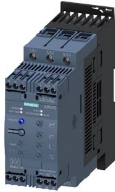
SIRIUS soft starter S2 72 A, 37 kW/400 V, 40 °C 200-480 V AC, 110-230 V AC/DC Screw terminals