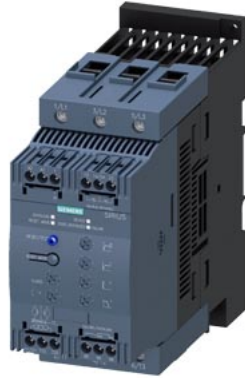
SIRIUS soft starter S3 106 A, 75 kW/500 V, 40 °C 400-600 V AC, 24 V AC/DC Screw terminals Thermistor motor protection