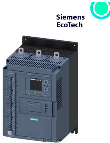
SIRIUS soft starter 200-480 V 171 A, 24 V AC/DC Screw terminals