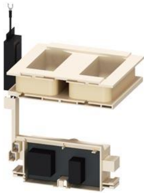
Magnet coil with switch-on electronics for contactor 3TF6844-.C..., 230...276 V AC 50/60 Hz