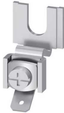
control wire tap for nut keeper kit 10 accessory for: 3VA10/11