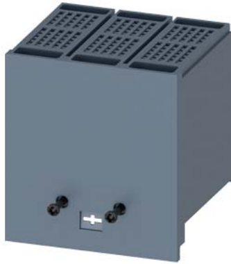
terminal cover extended 3-pole; 1 unit accessory for: 3VA10/11