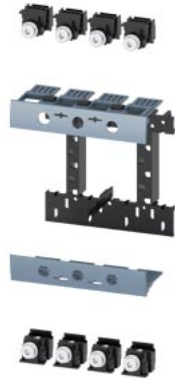
plug-in unit conversion kit for MCCB accessory for: circuit breaker, 4-pole 3VA11