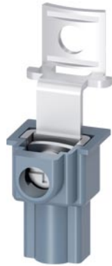
control wire tap for box terminal accessory for: 3VA10/11 plug-in version