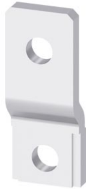
bus connector extended front mounted; 1 unit accessory for: 3VA11