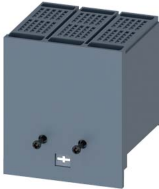
terminal cover long for plug-in and withdrawable socket accessory for: circuit breaker, 3-pole 3VA11