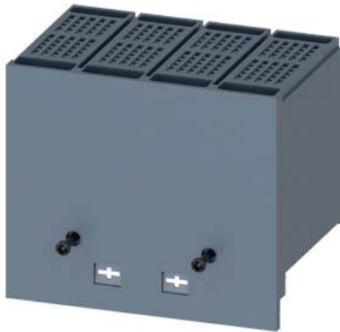
terminal cover long for plug-in and withdrawable socket accessory for: circuit breaker, 4-pole 3VA10/11