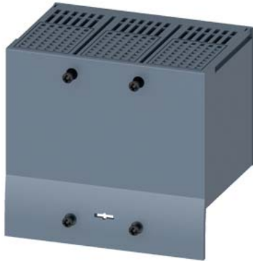
terminal cover long for plug-in and withdrawable socket accessory for: circuit breaker, 3-pole 3VA20/21/22